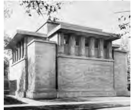
Figure 4: Unity Temple, photo from Frank Lloyd Wright Trust

Once students have practiced finding shapes in their everyday life, share images of different Frank Lloyd Wright architecture and have students find the shapes in his work.